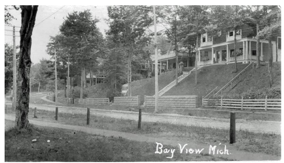
Muddy Woodland Avenue

For Ernest Hemingway, Northern Michigan was anything but black and white. Yet, the Bay View pictures from his time are all black and white. It is as if the Bay View grounds were drab and gray in those days.