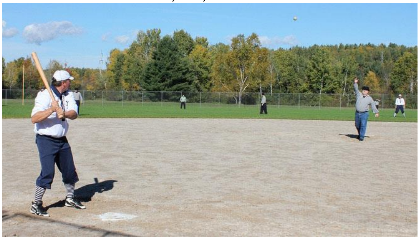
Petoskey Mossbacks vs the Cheboygan Shanty Boys Play Using Vintage 1860's Base Ball Rules

It was a beautiful fall afternoon when the MHS members who had stayed around Sunday afternoon went to a local ball field to watch the Petoskey Mossbacks play the Cheboygan Shanty Boys in a vintage baseball game. What fun! We had hotdogs, chips and pop available as we cheered the teams. They had vintage uniforms, strange rules --no gloves are used, only one baseball is used for the entire game, foul balls are not considered strikes, and you can catch a fly ball on one bounce and it is an out!-- and two teams of volunteers who love the game. The Cheboygan Shanty Boys are in their first season – and they included one woman. The Petoskey Mossbacks, a more seasoned team, won – in an extremely lopsided score. But that was not the primary goal of the game. These people come out on a beautiful day to show the small crowd how the game was played a century ago and how much they love what they do. MHS had about fifteen members and spouses who turned out. I was one of those, and it was GREAT!!!